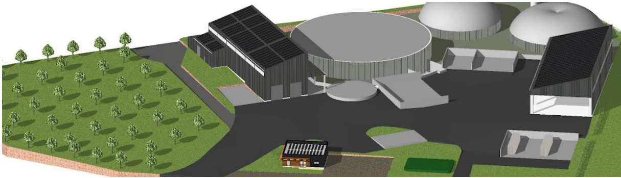
Picture (1): Expected stereoscopic drawing 400 Nm 3 /h SAS Enerfées biomethane plant